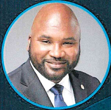
17TH DISTRICT STATE SENATOR ELGIE SIMS