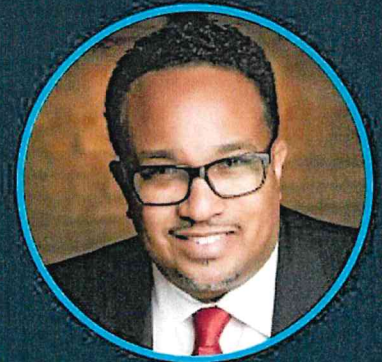
4TH DISTRICT COMMISSIONER STANLEY MOORE